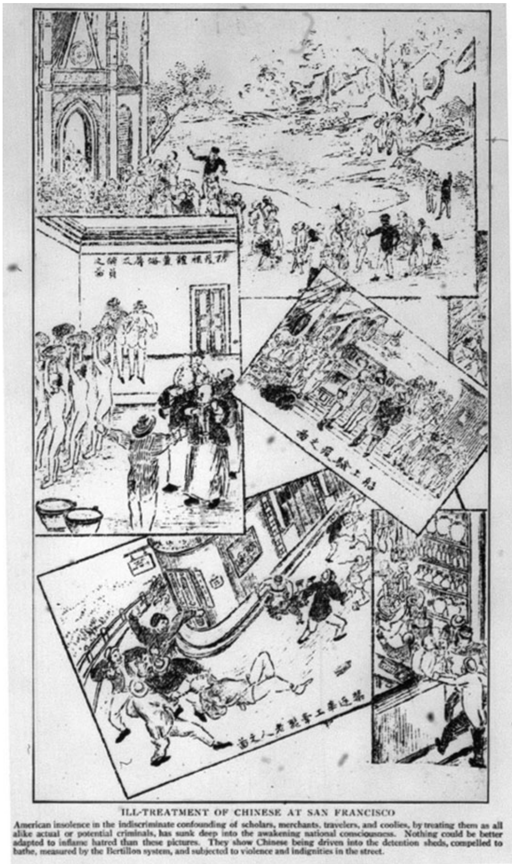
FIGURE 4. This collection of boycott flyers, gathered and reprinted by missionary Arthur H. Smith in 1906, shows Chinese people in the United States being attacked in the streets by American mobs, driven into detention sheds and forced to bathe. The lesson Smith took away from them was that “the indiscriminate confounding of scholars, merchants, travelers, and coolies” had “sunk deep into the awakening national consciousness.” From “A Fool’s Paradise,” Outlook 82:12 (March 24, 1906), pp. 701–6.