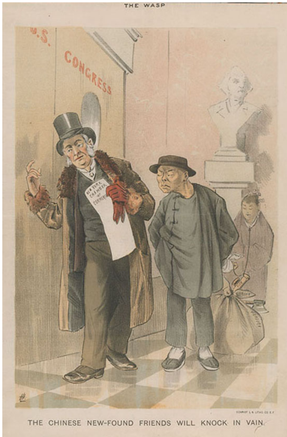
FIGURE 2. This 1889 cartoon from The Wasp criticizes the U.S. corporate efforts—here represented by the New York Chamber of Commerce—to lobby Congress on behalf of the entry of Chinese migrants and the vices they carry with them. The woman standing behind the Chinese man may be his wife—a reference to the permission granted to the spouses of the “exempt” to migrate—or she may (in reference to the “Vices” in the man’s bag) be a symbol of prostitution, consistent with the attribution of “immorality” to Chinese migrant women.

demagogue Dennis Kearney had once rallied San Francisco mobs with the infamous applause line “The Chinese Must Go!,” missionary Esther Baldwin, by contrast, plaintively titled her otherwise sardonic, pro-immigration reply Must the Chinese Go? The exemplary figure here was missionary Luella Miner who, in 1902, lobbied on behalf of two