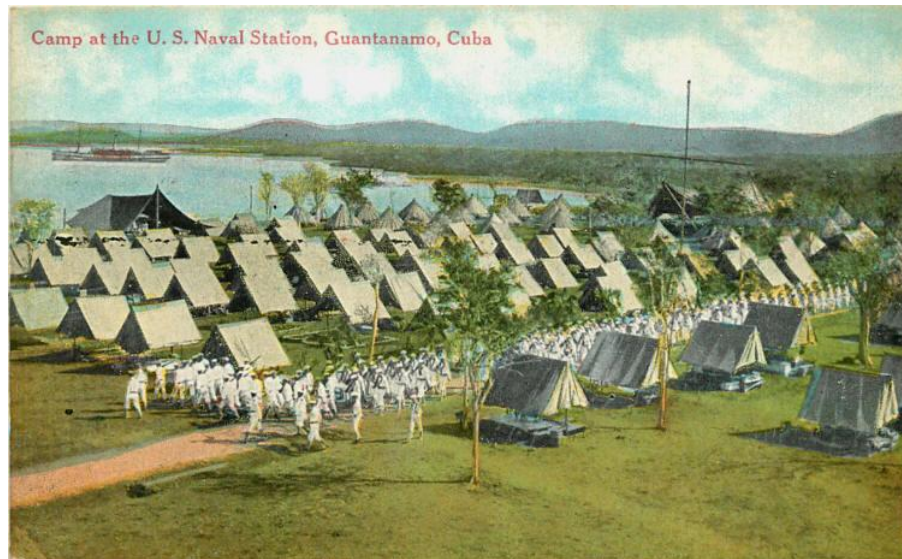
1908 postcard of a US naval encampment at Guantánamo Bay. The failure of the United States to build up the base raised questions about whether it was worth possessing it at all.