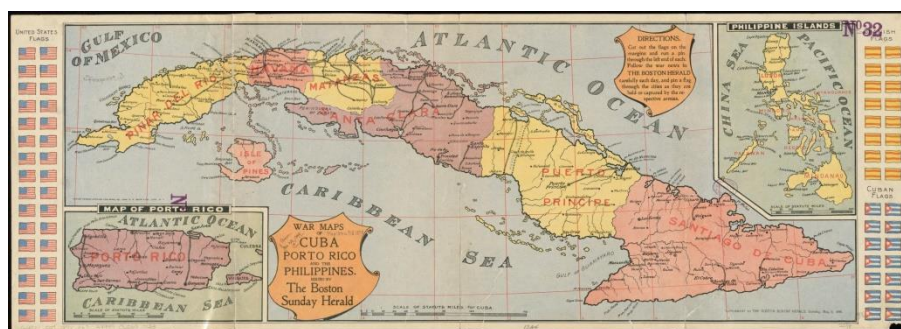
“War map” from 1898, featuring Cuba, Puerto Rico, and the Philippines. By the 1890s, US policymakers were seeking strategically-positioned territories for military bases and coaching stations in the Caribbean and Asia.

He was not far off. In pursuit of a wider dominion over the Caribbean and rising commerce in the Pacific via the still-hypothetical canal, military planners pushed for naval bases and coaling stations in Cuba, “an outer bar of the Mississippi,” in the words of one naval officer. The war was scarcely over when, in August 1898, the Naval War Board inventoried potential U. S. coaling station sites on the island; surveys quickly identified Guantánamo, with its wide channel and proximity to the Windward Passage, as the “best site in the Caribbean,” according to one commander.