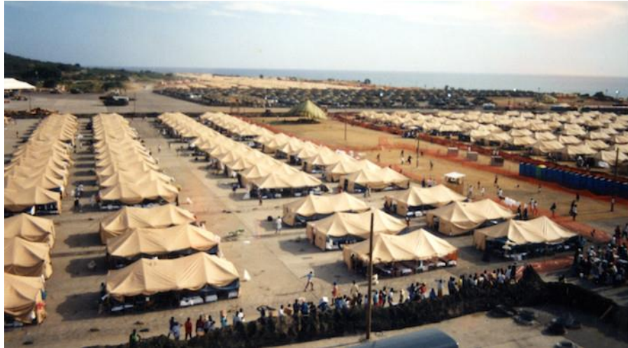
Refugee tent-city at Gitmo. By 1994, the base held nearly 37,000 Haitian and Cuban refugees who had been intercepted by the US Coast Guard as they escaped oppressive conditions.

The answer was Gitmo. By November, 1991, the U.S. Coast Guard was shipping Haitians to the base. By the following July, nearly 37,000 people were confined in makeshift tent cities ringed with barbed wire.