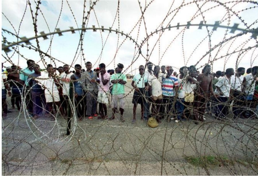
Haitian refugees imprisoned at Gitmo. Concerned with the political implications of large-scale Haitian immigration for his re-election, the George H. W. Bush administration directed escapees to Gitmo, where they protested harsh conditions and slow asylum processing.