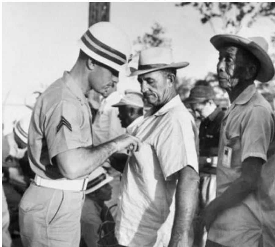
US guards examining Cuban base workers, 1960. Gitmo depended heavily on Cuban workers, and suspected them of stealing base supplies and aiding the Cuban revolution.

Both during the Cuban revolution and after its triumph, the base would prove useful to Fidel Castro in ways that irked the American tenants, if that's what they were. The revolution's official position was that the lease was invalid by virtue of its coercive origin and would, in any case, be nullified by a change of regime. But the revolution made use of the base, too. It was the source of American hostages that revolutionaries seized on several occasions in retaliation against Gitmo's real and imagined support for Batista. Base workers who sympathized with the revolt smuggled out bullets, spare parts, clothing, and gas.