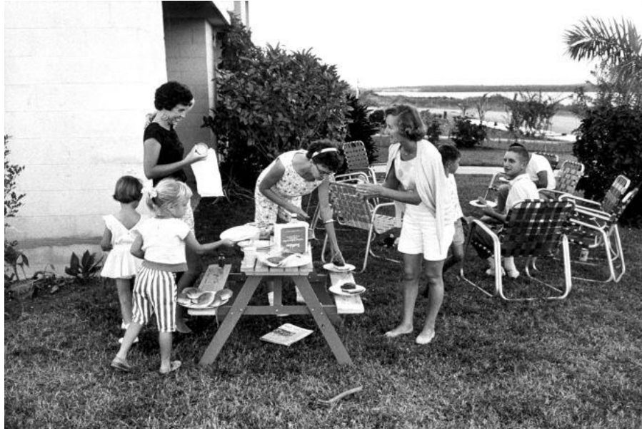
American families set up a backyard picnic at Guantánamo Bay. By the 1950s, American residents on the base enjoyed many of the consumer amenities that characterized suburban life in the mainland US.

“Guantanamo Bay is in effect a bit of American territory, and so will probably remain as long as we have a Navy.”