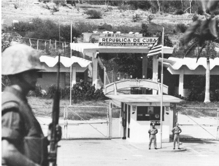
Gitmo's dual Northeast gate, 1969. Cold War antagonism between the US and Cuba led American authorities to fortify the base and close it off from the rest of the island.

Physical isolation defined the daily reality of naval officers, sailors, base workers, and their families. They nicknamed Gitmo “The Rock.” A base is usually a place of supply; Gitmo utterly depended on the outside world. Auto parts could take three months to arrive, so base personnel jerry-rigged “Gitmo specials” from scavenged parts. No longer able to buy from Cuban suppliers, the base imported most of its food and all its supplies through containerized cargo ships after 1972. Fresh vegetables, nearly impossible to grow in Guantánamo’s parched soil, were flown in from Norfolk, Virginia, the far end of the base’s logistical lifeline. After efforts to secure fresh milk collapsed, the base settled on “filled milk,” an amalgam of milk powder and vegetable fat generated in a plant that Cubans mocked as a “mechanical cow.” By the mid-1980s, the base could generate three million gallons of desalinated water each day, but the plant ran on high-priced fuel. The United States had secured its independence from Cuba’s infrastructure, but Gitmo residents drank the most expensive water on earth. As for “liberty,” it now meant a short flight to the brothels of Kingston and Port-au-Prince.