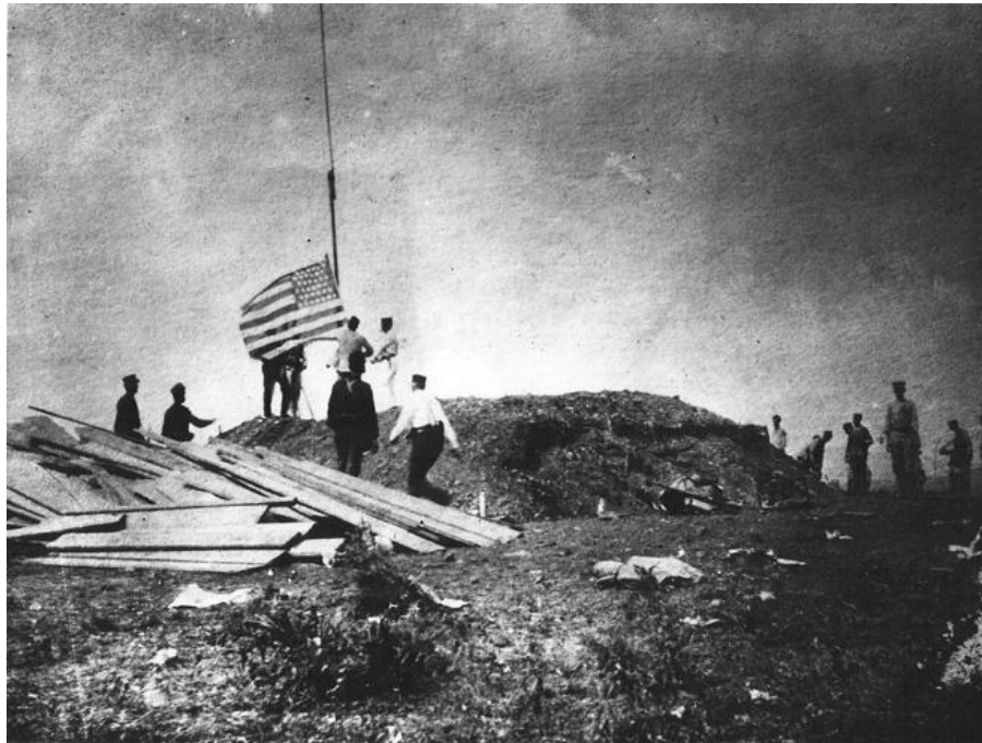
US forces hoist the American flag at Guantánamo Bay, Cuba, June 12,