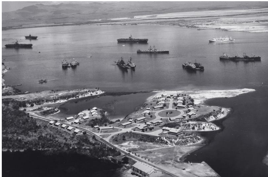
The U.S.S. Little Rock CL 92 with the 8th Fleet at Guantánamo Bay, early May 1946. During World War II, the US built Gitmo into a major naval training center, convoy hub, and the second-busiest port in the Western Hemisphere, after New York.

While the boundaries of the base were indefinite, it was, in the twenties and early thirties, clearly outside the precincts of Prohibition. Water was not the only liquid that flowed from Cuban towns to the U. S. base. Officers stocked their cabinets with alcohol from Cuban suppliers. Sailors crammed bars in Caimanera and Guantánamo City, seeking rum and economically vulnerable women; this was called “liberty.” For many, the base was a weird cocktail of dull heat, lassitude, and excess. Morally and geographically, it was, one visitor wrote, “on the fringes of things.”